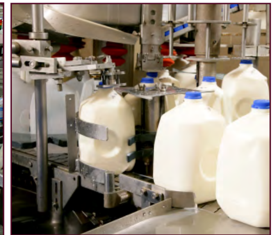
Left: Milk will be provided to children in schools in surrounding urban communities. Above: The city of Newark will soon be home to a new milk pasteurization, processing and cheese production plant as a result of financing through the WINN Program.