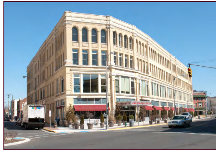
Top: Springwood Avenue Senior Center Above: Steinbeck Building located on Cookman Avenue