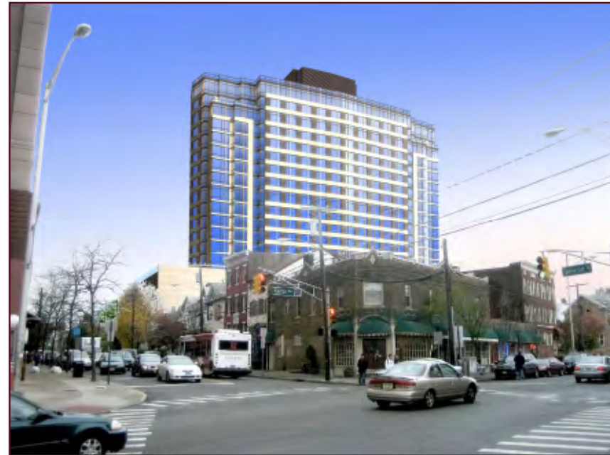
Above: The 14-story Somerset Mews Redevelopment Project will bring market-rate rental units to New Brunswick. Right: City map displays the project location.

Over the last 30 years, the city of New Brunswick has experienced a major transformation to its downtown area. The City boasts of the Heldrich Hotel and Conference Center and new market-rate rentals and affordable homeownership units. As part of the Easton Somerset Redevelopment Plan, the next progression is the development of market-rate rental units.