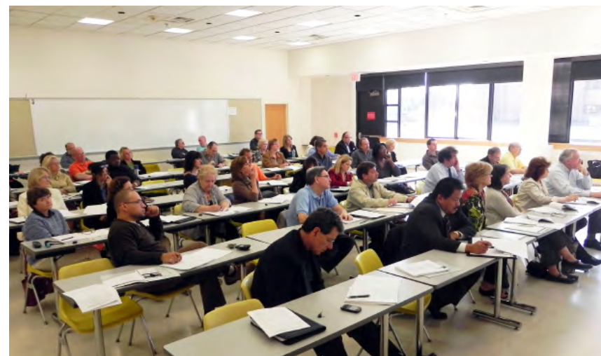
Page 6 and 7: Nonprofit and for-profit developers, professional consultants, entrepreneurs and local and county government take advantage of multi-day NJRA RTI courses throughout the year that offer knowledge on the redevelopment planning law in New Jersey, real estate project feasibility and project finance.

In addition to financial resources, NJRA provides comprehensive technical assistance to 69 eligible urban communities throughout the state. Through its efforts it became evident that more knowledge about the redevelopment process was needed. As a result, NJRA expanded its technical assistance arm to the entire state through the NJRA Redevelopment Training Institute (NJRA RTI).