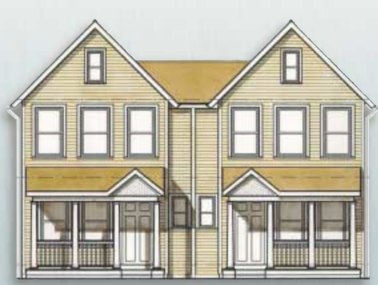
Right: One- and two-family homes will be constructed on 10 targeted sites throughout the City of Plainfield.

construction company. A heavy equipment and vehicle maintenance garage and a staging area for materials and equipment installation will be relocated here. Two new businesses will also be created including a new waste concrete and tree mulching recycling services facility.